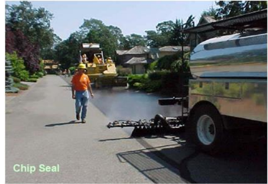
Photo shows work being done to preserve a Pierce County roadway.